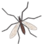
crane fly (daddy-long-legs)